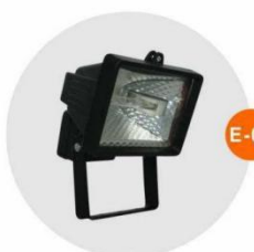
E-05 泛光燈 (小太陽) Halogen floodlight 500W