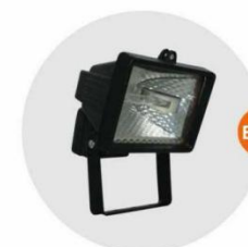
E-04 泛光燈 (小太陽) Halogen floodlight 300W