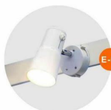
E-01 射燈 (白色) Spotlight (White) 23W