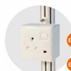
E-12 插座 (不能用於照明用電) Single Phase Socket (for machine only) 1000W(220V)