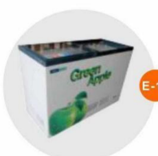
E-11 座地冷凍冰箱 (-18度)(不包括電插座) Sitting Style Refrigerator (-18°C, Excluding Socket) 1.2